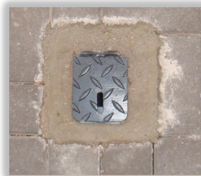
Base sits flush when not in use

Powder coated Semi Matt Black and a white vinyl stripe complete with the ground socket (replacement ground sockets available)